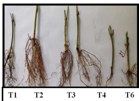
Figure 4. Root architecture on different treatment.

Among three most potential plant growth promoting actinobacteria were selected, all actinobacterial isolates are efficient for promoting plant growth. These isolates may further be evaluated under field conditions for plant growth promotion, disease suppression and drought tolerance ability.