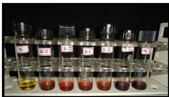
Figure 2. IAA production by actinobacteria.

pink colour in presence of tryptophan. All 35 isolates found to be positive in the preliminary screening for IAA production were used for quantitative estimation under in vitro. IAA production varied with isolates from 0.43 g ml -1 to 15.9 g ml -1 (Figure 2 and Table 3). The isolates Ptd-A and Amb-C were found to be significantly superior to all other isolates, with IAA production of 15.9 g ml -1 and 15.38 g ml -1 respectively. Similar study conducted revealed that 51% of the mangrove actinobacterial isolates produced IAA in the range of 0.21 g ml -1 to 165.74 g ml -1 .