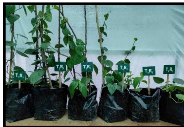
Figure 3. Effect of PGPM on plant growth.

number of leaves and internode length throughout the growth period from planting to five MAP (Figure 3 and Table 7).